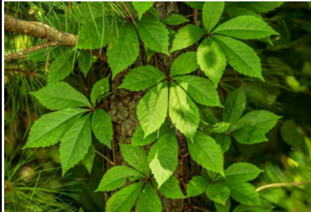
Virginia creeper ( Parthenocissus quinquefolia )