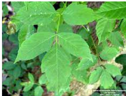
Boxelder ( Acer negundo )