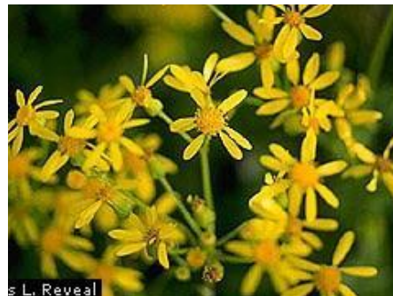
Texas ragwort ( Senecio ampullaceus )