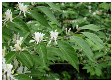
Honeysuckle ( Lonicera sp.)