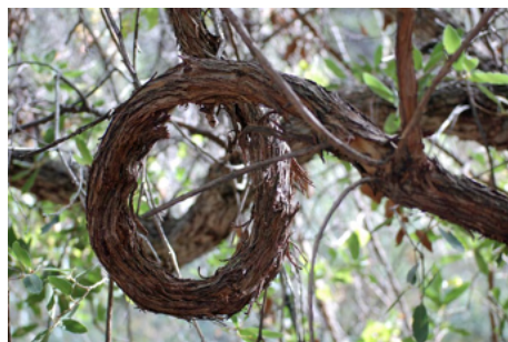
Wild grape ( Vitis sp.)