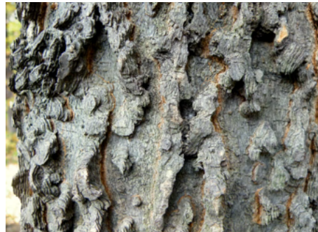
Hackberry ( Celtis occidentalis )