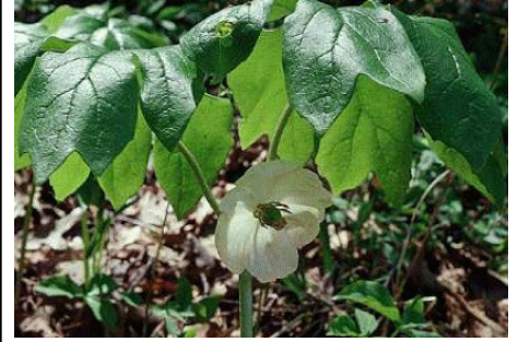
Mayapple ( Podophyllum peltatum )