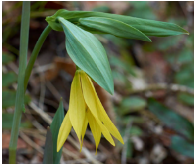
Bellwort ( Uvularia grandiflora )