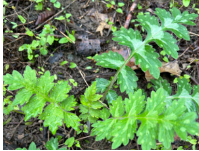
Virginia waterleaf ( Hydrophyllum virginianum )