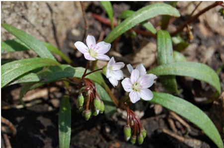
Spring beauty ( Claytonia virginica )