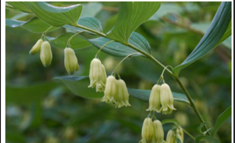
Smooth solomon's seal ( Polygonatum biflorum )