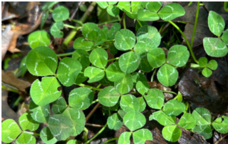
White clover ( Trifolium repens )