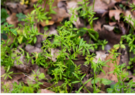
False mermaid ( Floerkea proserpinacoides )