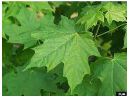
Sugar maple ( Acer saccharum )