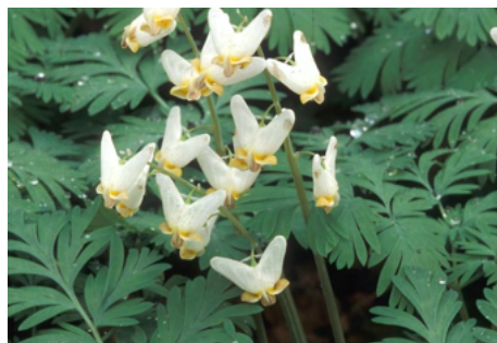
Dutchman's breeches ( Dicentra cucullaria )