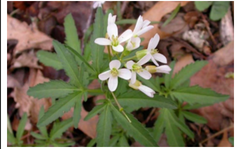
Cutleaf toothwort ( Cardamine concatenata )