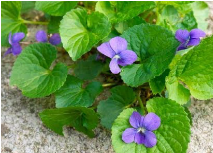
Violet ( Viola sp.)