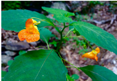
Spotted jewelweed ( Impatiens capensis )