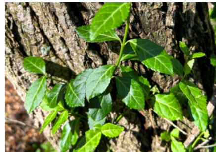
Wintercreeper ( Euonymus fortunei )