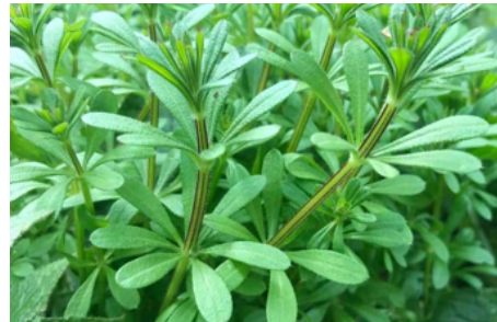
Cleavers ( Galium sp.)