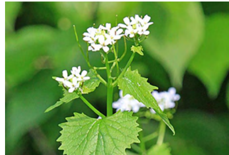
Garlic mustard ( Alliaria petiolata )